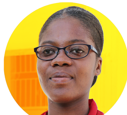
VALENCIA SEANCE EDUCATIONAL GUIDANCE COUNSELOR